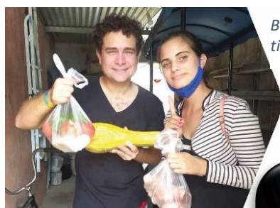
Blessing the Deaf in their time of need.