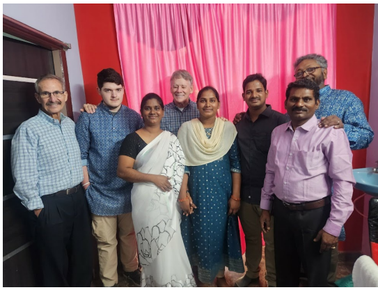
ICCD Team and India Partners