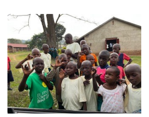
Uganda Deaf Students Jinja, Uganda