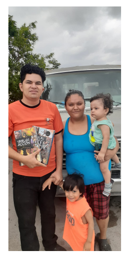
A Deaf evangelist in Mexico receiving the Action Bible