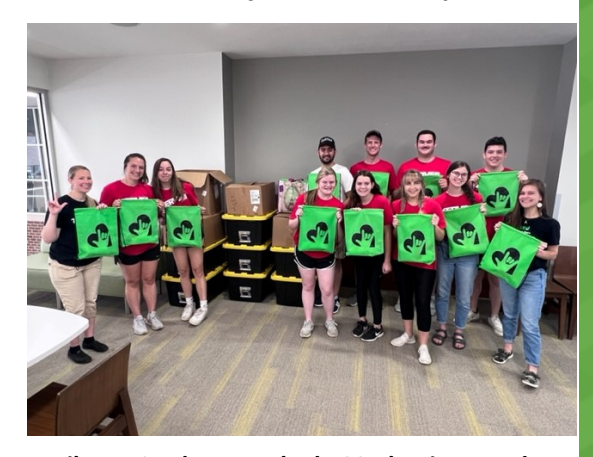
Liberty Students Packed 500 Blessing Bags!