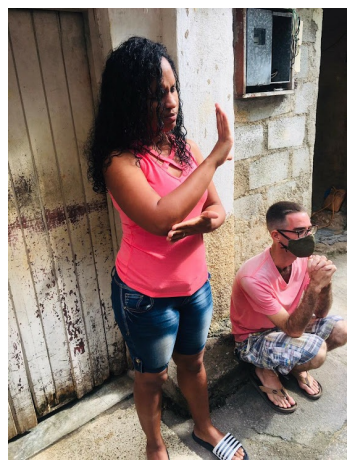
A Deaf woman in Cuba leading the Deaf meeting in prayer.

If you live in the Roanoke, Virginia area we'd love for you to join us as we celebrate International cultures and specifically International Deaf cultures. We will have a booth where you can come and see videos of our Deaf ministry workers signing songs, drama, and more! We will also be making jump ropes to take on mission with us.