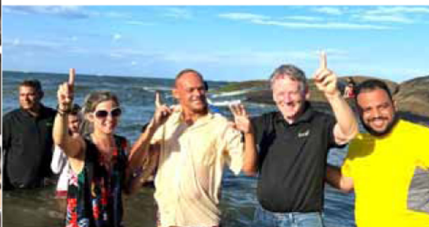
Brazil Baptisms 2023