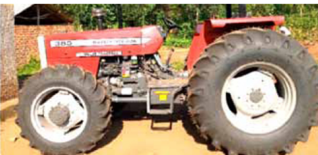
New Tractor for the Farming Project in Uganda.