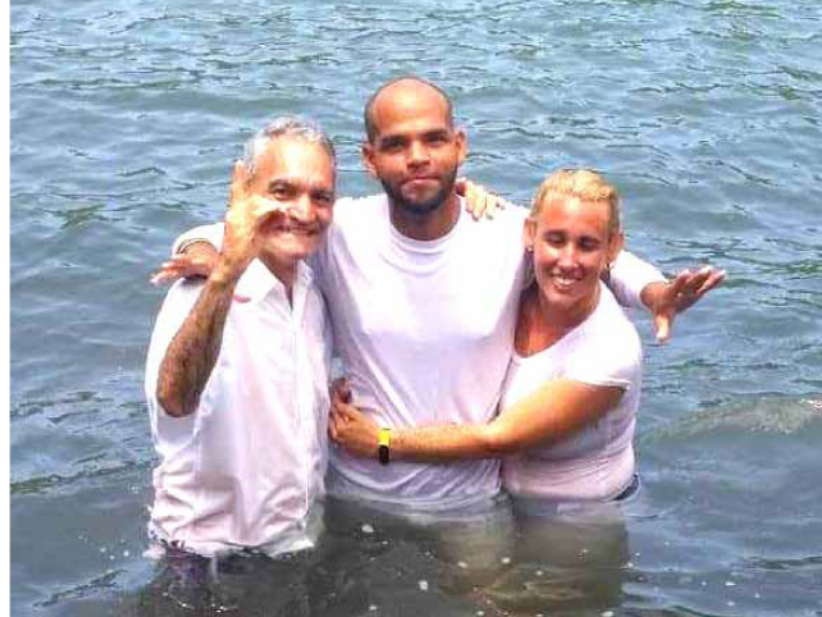
Cuba Baptism 2023